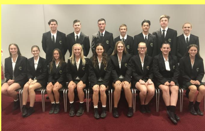
Top: The redevelopment continues at a rapid pace. We're all looking forward to seeing what the school looks like at the start of the new school year. Above: Hunter Sports High athletes were honoured at the Hunter School Sports Association Awards last week. See further in the newsletter for more details.